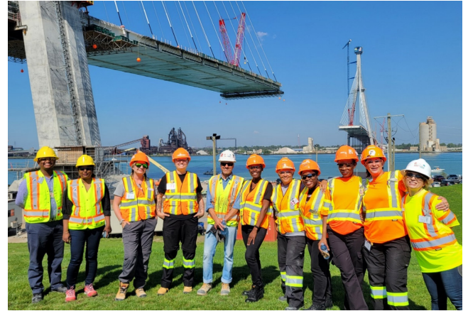
Women's Enterprise Skills and Training (WEST) of Windsor program participants tour the Canadian project site in July 2023.