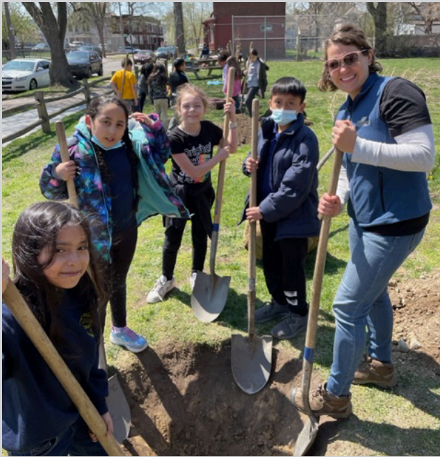
The TreeKeepers Kids program planted 26 trees in Delray/Southwest Detroit in spring 2023.