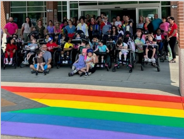
John McGivney Children's Centre's main entrance painted in the colours of the Progressive Rainbow Flag.