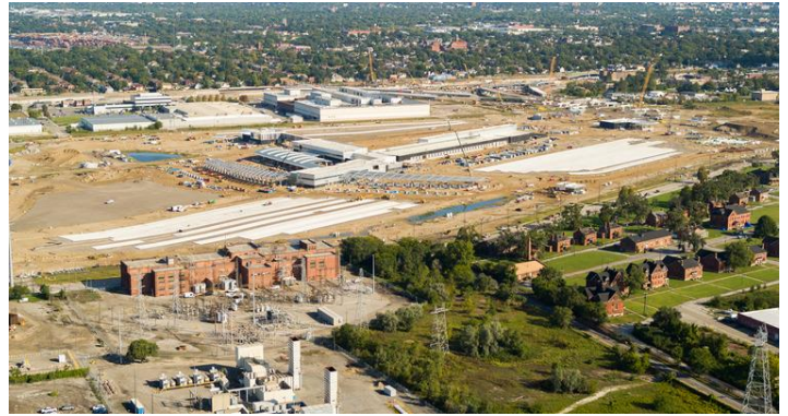
US POE construction.

Paving and grading work is occurring throughout the site as well as stormwater management pond work and underground utility installation.