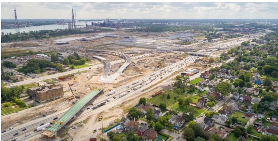
Michigan Interchange construction.

Siphon construction is taking place on Dagoon Street, Morell Street and Ferdinand Street with sheet piling and excavation work.