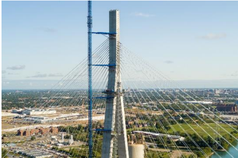
US bridge tower construction (top) and Canadian bridge tower construction (bottom).