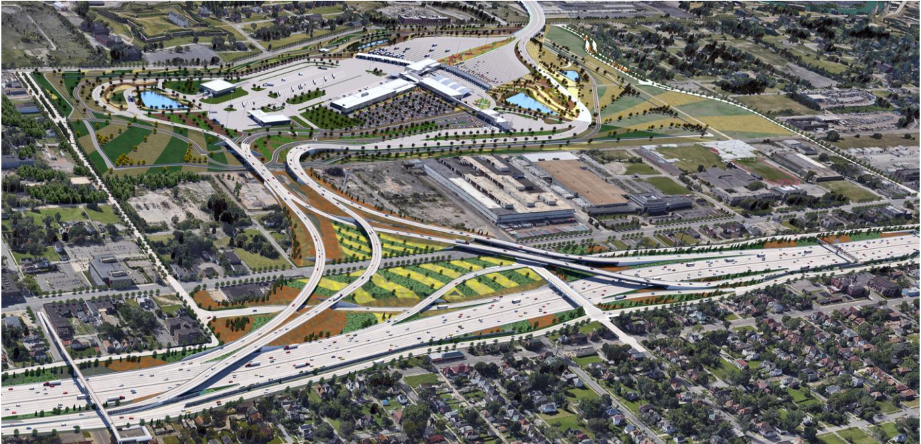
Design rendering of I-75 and US POE connector ramps