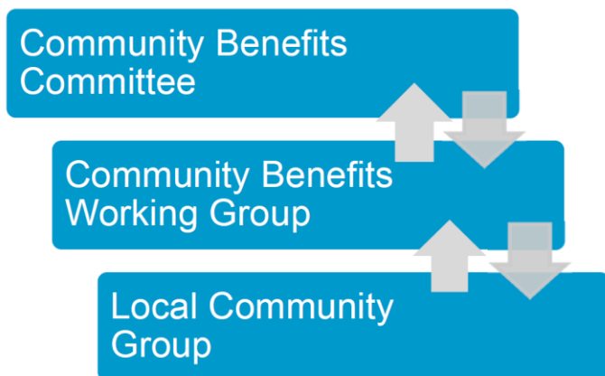
FIGURE 1: GOVERNANCE STRUCTURE